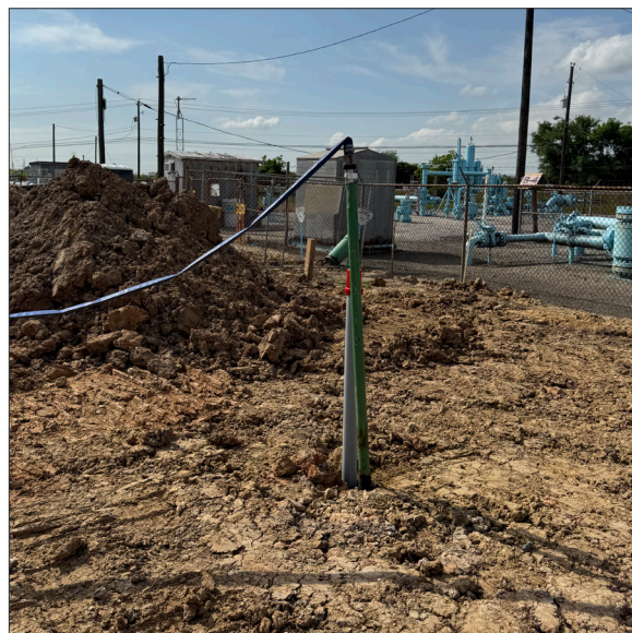
Injecting ZERUST® corrosion inhibitor solution into the annular space of the pipe casing.

Asset ID: Pipe Casing Casing Diameter: 16 inches (≈ 406 mm) Pipeline Diameter: 12 inches (≈ 305 mm) Length: 80 feet (≈ 24.4 meters) Vent Pipes: Two 3-inch (Top and Bottom orientation) (≈ 76 mm) Elevation Changes: Minimal Weather During Application: 75°F (≈ 24°C), 75% humidity, cloudy